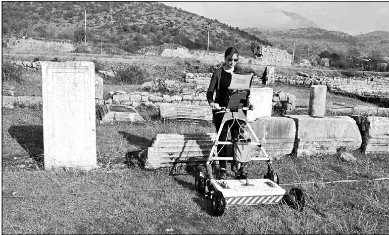
Fig. 1 – IDS RIS-K2 Georadar during data acquisition.

the depth they reached may be estimated accurately too. The performance of the system is influenced by the electromagnetic properties of the medium they are used on: this determines the depth the survey can reach, which varies, therefore, from point to point.