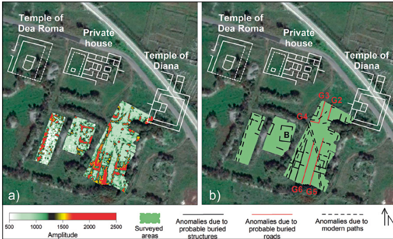
Fig. 3 – GPR results in the southern part of the private houses: time slice relative to the time window 14-18 ns (about 0,7-1,4 m in depth), overlapped on the photogrammetric image (a) and identification of anomalies (b).

which the electromagnetic wave fulfils the path transmitter antenna-discontinuity-receiver antenna). Data was then gridded using a kriging routine and a radius of interpolation equal to 0.75 m.