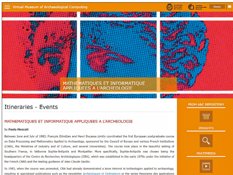
Fig. 6 – The interactive itinerary of the VMAC dedicated to the first European postgraduate course on Data Processing and Mathematics Applied to Archaeology (Valbonne-Montpellier 1983), by Paola Moscati.