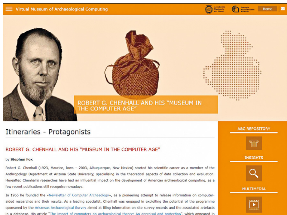
Fig. 3 – The interactive itinerary of the VMAC dedicated to Robert G. Chenhall, by Stephen Fox.

Several approaches to the subject matter soon emerged. They can be closely related to the diverse background and research purposes of the three scholars and, in general, to the new quantitative approach in archaeology. Indeed, a wide range of scientific methods and instruments increasingly became part of archaeological research: from statistical techniques to automatic data processing, from archaeometric data analysis to geophysical prospection techniques, from information retrieval systems to data banks, from aerial photography to remote sensing methods, etc. Archaeological research was, therefore, provided with the possibility of building up a new