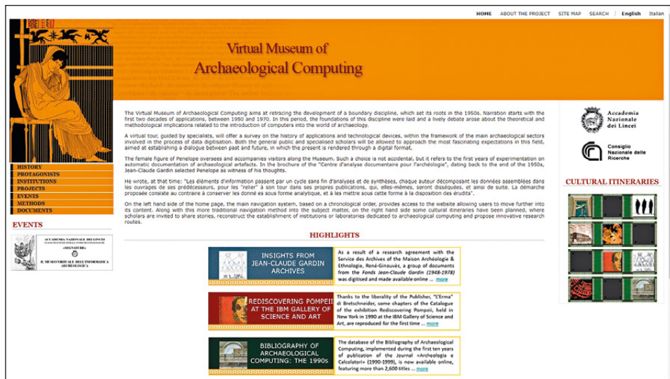
Fig. 1 – The homepage of the Virtual Museum of Archaeological Computing (VMAC): the Bibliography of Archaeological Computing is listed among the Highlights.

made available online in the Virtual Museum of Archaeological Computing (MOSCATI, ORLANDI 2019), featuring more than 2,700 titles.