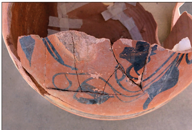
Fig. 2 – Detail of a reconstructed vase from fragments found in Room B and in the space in front of Room A of tomb AGH026 (EIMAWA: Egyptian-Italian Mission at West Aswan).

functioned as a monumental bed. A long niche was cut on the E side. Inside, six small mummies had been deposited, that need to be closely examined. On the W side there are two other niches of which one was found empty while the second contains two bodies still covered in bandages and in good condition, that will be X-rayed and CT-scanned. In the higher level of the room lay over 20 mummies, badly preserved mostly, due to damage by ancient thieves, who ripped off their bandages and their cartonnages in search for precious goods. On completion of the excavation and study, all mummies will be probably relocated in their original positions, in an ethical attempt to preserve their original desire for eternal burial.