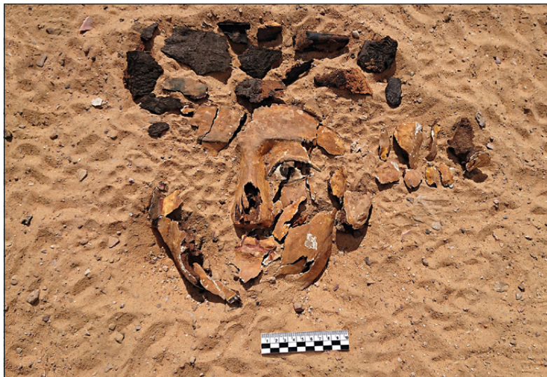
Fig. 3 – Fragmentary wooden mask, from Room B of tomb AGH026 (EIMAWA: Egyptian-Italian Mission at West Aswan).

We also found an impressive quantity of mummy bandages. Most of the strips are ecru but many are dyed, especially red. A technical sheet has been developed, with all the characteristics of the specific textile, for insertion into a database. Experts in “Big data” of the University of Milan have started working with EIMAWA in order to organize all the information collected during the excavation, the topographical work, and the study of the necropolis. On the basis of the objects discovered and their context, it has been deduced that tomb AGH026 was used over many centuries probably in two different periods, from the 4 th century BCE to the 1 st century CE. It was surely robbed in antiquity but has not been disturbed in recent times.