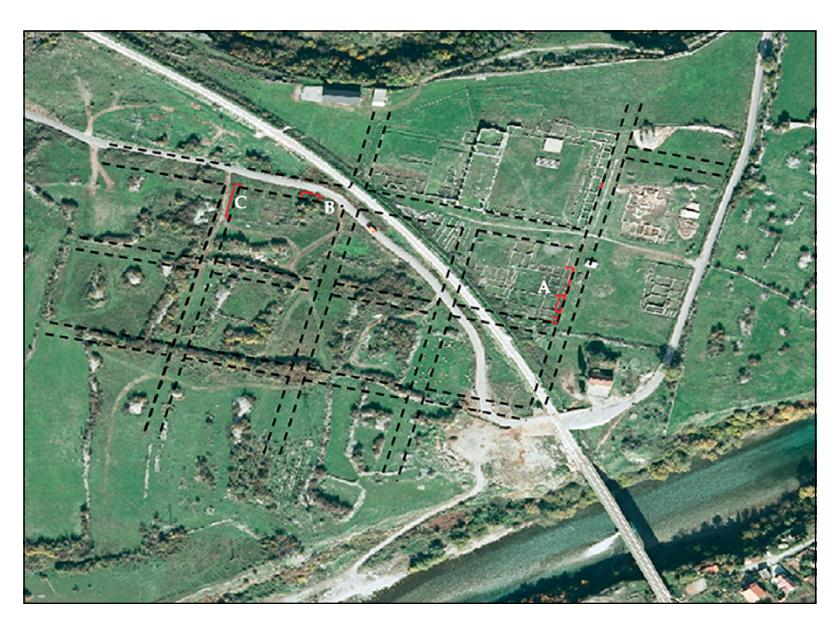
Fig. 6 – Satellite image of Doclea. In red, the ancient structures that overlap the Roman roads.

flanked along the southern side by a covered walkway. The geophysical anomalies identify the colonnade (see COZZOLINO, GENTILE this volume) and a base of a column came to light during the archaeological excavation. The considerable size of the decumanus of Doclea can be compared with those of some Augustan cities of northern Italy, characterized by a regular layout, but conditioned by an important pre-existent communications network, such as Libarna, Verona, Concordia and Tridentum (Libarna: PANERO 2000, 115-131; Verona: CAVALIERI MANASSE, BRUNO 2003; Concordia: CONVENTI 2004, 132-134; Tridentum: CONVENTI 2004, 141-143; ROSSI et al. 2008). The main axes of the cities were frequently embellished over time as happened, for instance, at Aquileia where paved roads lined with porticoes are positioned close to the forum (BERTACCHI 2003; MUZZIOLI 2004).