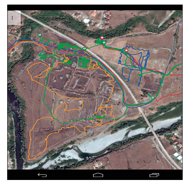
Fig. 2 – The territorial survey. The image displays the survey routes followed on three different days, as registered by tablet.