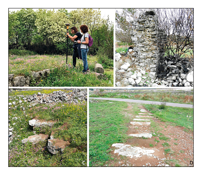
Fig. 3 – A: acquisition of coordinates by means of differential GPS; B: corner of a masonry structure standing in the SE part of the Doclea plateau; C: paving in limestone slabs covering a channel in the SW part of the plateau; D: stone paved road identified during the survey.