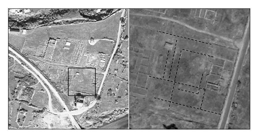
Fig. 5 – Satellite image of the forum area. On the right, the archaeological photo-interpretation of the thermae zone (World View-3 satellite image belonging Google Earth<sup>™</sup> 2017, Google Inc. acquired on 15<sup>th</sup> June 2015).

archaeological excavation conducted by the Centre for Conservation and Archaeology of Montenegro. This structure could be a tower or bastion with the defensive purpose of controlling men and animals entering the Roman city.