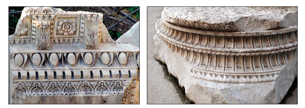
Fig. 1 – A fragment of trabeation (a) and a basis of a Corinthian column (b).