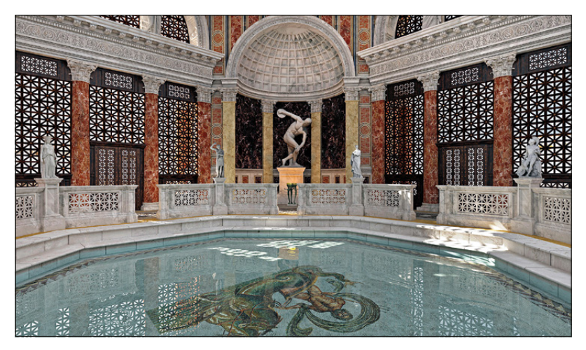
Fig. 7 – 3D reconstruction of the Sala Ottagona (little frigidarium ).

A reconstructive proposal of Diocletian's Baths for the 5G experimentation in Rome