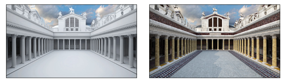
Fig. 6 - a) 3D model without textures of the palestra. See at the top-left of Paulin's reconstruction for a comparison; b) 3D reconstruction of the palestra with mosaic floor restoration and reconstituted fragments.