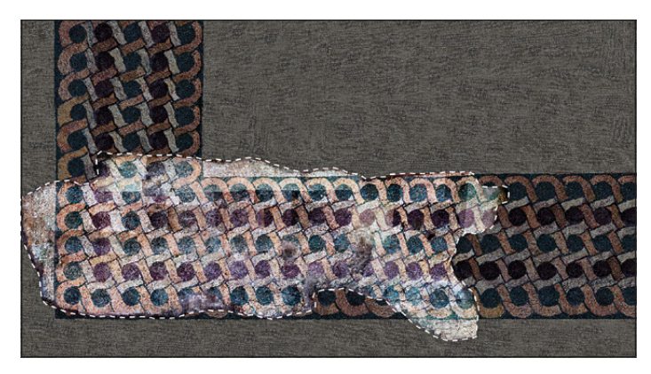
Fig. 4 – The virtual restoration of the mosaic located in via Cernaia.