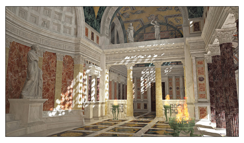
Fig. 8 – Interiors 3D reconstruction.

architectural elements have been restored starting from the preserved ones, but the aim of the project is to offer a reconstructive proposal with a double purpose: to provide the visitor with tools for a knowledge of the good in line with the potential of modern technologies, and to represent the thermal complex with a complete re-enactment solution.