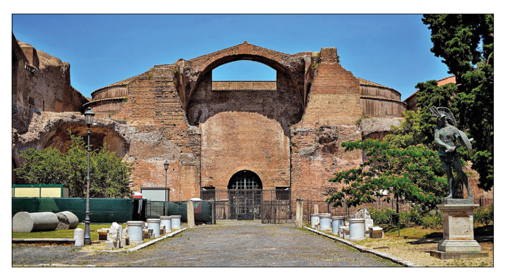
Fig. 3 – The Baths nowadays.

A reconstructive proposal of Diocletian's Baths for the 5G experimentation in Rome