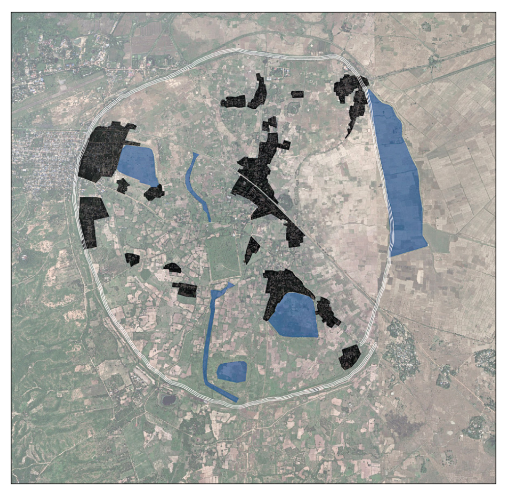
Fig. 2 – Elaboration by the author from Google Earth (Maxar Technologies) satellite image of Sri Ksetra. In the site, within the ramparts, 20 villages are still inhabited and the presence of rural activities is prevalent, as evidenced. Ancient ponds and water infrastructures are represented in blue, as based on literature (STARGARDT et al. 2012).