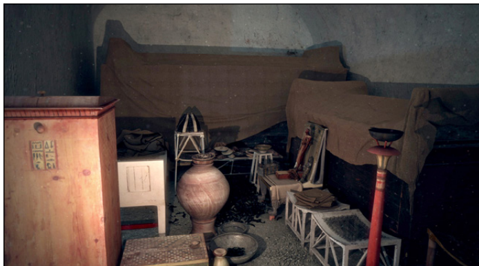
Fig. 1 – Tomb of Kha , 3D reconstruction of the burial chamber.