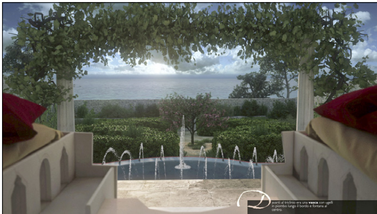
Fig. 3 – The House of the Golden Bracelet, 3D reconstruction of the garden.

On the occasion of the exhibition Visions of Egypt two movie documentaries were produced about the House of Octavius Quartio and the House of the Golden Bracelet, two important domus characterized by the presence of paintings and sculptures inspired by the Egyptian culture. In both cases,