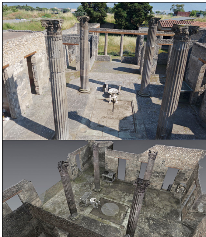
Fig. 1 – The House of Obellio Firmo, panoramic view and laser scanning survey 2016 of the tetrastyle atrium.

employing systematically laser scanning and photogrammetry methods in the direction to generate a geometrically and photometrically accurate 3D model of the whole building. To reach this goal we decided to repeat the laser scanning survey carried out during the Piano della Conoscenza , employing a laser scanner of new generation, which fosters the acquisition of highest quality 3D data and HDR imaging, warranting range and angular accuracy paired with low range noise and survey-grade dual-axis compensation. The new employed instrument led to a highly detailed 3D colour point clouds mapped in realistic clarity (Fig. 1).