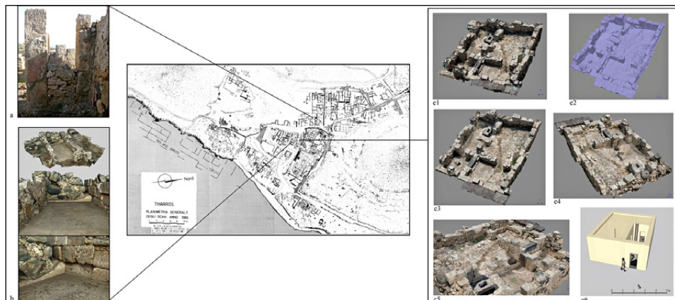
Fig. 4 – Archaeological map of Tharros (PESCE 1966, Planimetria generale degli scavi anno 1965) with the contexts involved in 3D relief by laser scanner and photogrammetric method: a) Eastern wall of building no. 20; b) 3D model of building no. 58 (MARANO, SILANI in press); c) Point cloud (c1), mesh (c2), NW view of 3D model (c3), SW view of 3D model (c4), SE detail view of 3D model (c5) and reconstruction of the first phase (c6) of building no. 56. Data acquisition and processing: M. Marano.

In the processing phase, the first step has been a specific analysis of the acquired images filtering the 3D point cloud in order to delete the noise elements caused by earth layer and vegetation in the site. The point cloud (Fig. 4, c1) was obtained through the alignment by homologous points, coloured and decimated for modelling process in order to achieve the final 3D texturing restitution (Fig. 4, c3-5).