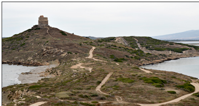
Fig. 1 – Tharros, the gulf, the San Giovanni hill and the isthmus Sa Codriola. Author: A.C. Fariselli.

objective is to gain an overall vision of the city's main historical phases and of its relation to suburbia.